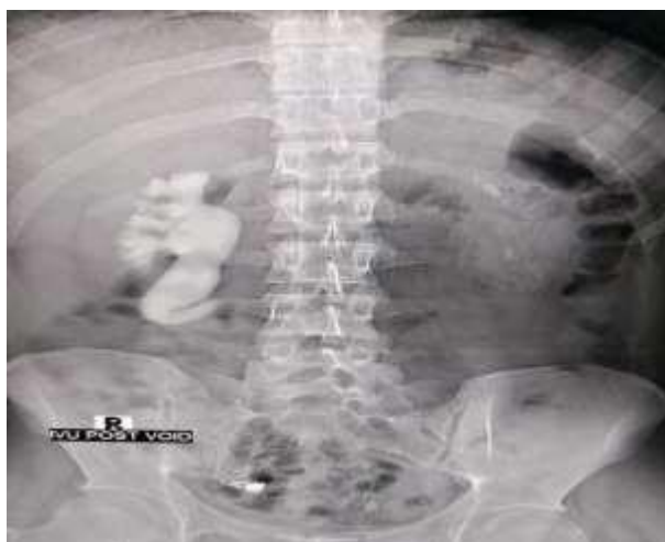
Figure 3: Intravenous urogram (IVU) showing Fish-hook shaped deformity

Intravenous urogram (IVU) was also done to confirm dilated ureter was coursing behind IVC, showing a Fish-hook sign.