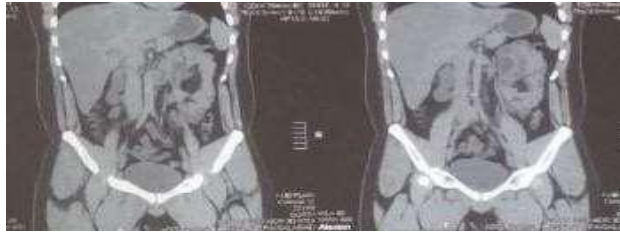
Figure 1: Coronal computed tomography of the abdomen and pelvis showing a visible intravenous contrast-dilated ureter flowing beneath the inferior vena cava. (Fish-hook sign)

The patient had retrocaval ureter-related moderate hydronephrosis, although he showed no symptoms for a few years. But he came with right flank pain for one month. A renal scan showed adequate functioning of the left kidney was seen with no outflow obstruction, whereas the properly functioning right-